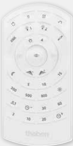
theSenda P service remote control