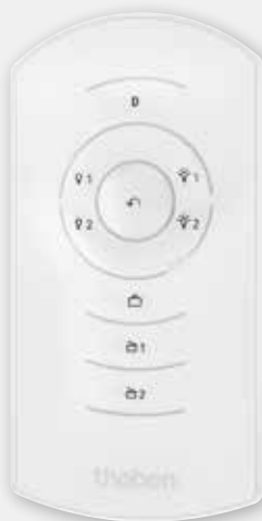
theSenda S user remote control

As an option, thePiccola P can also be set with the SendoPro 868-A management remote control.